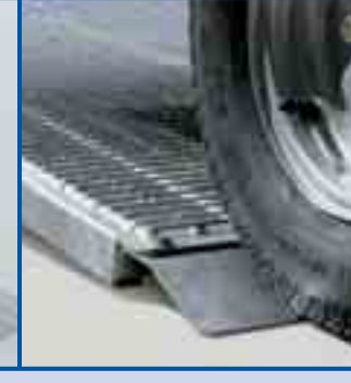
Knife edge for ramp

Can be fitted to LT/LM models with or without dropsides/ meshsides.