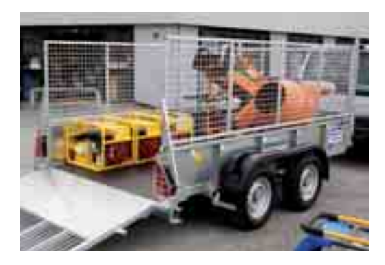
Canopies are available for most makes of 4x4 vehicle as well as being an option for some trailers. For more details please contact your local distributor.

Meshsides are available for most models, providing the capability to carry bulky loads such as hedge cuttings and waste packaging.