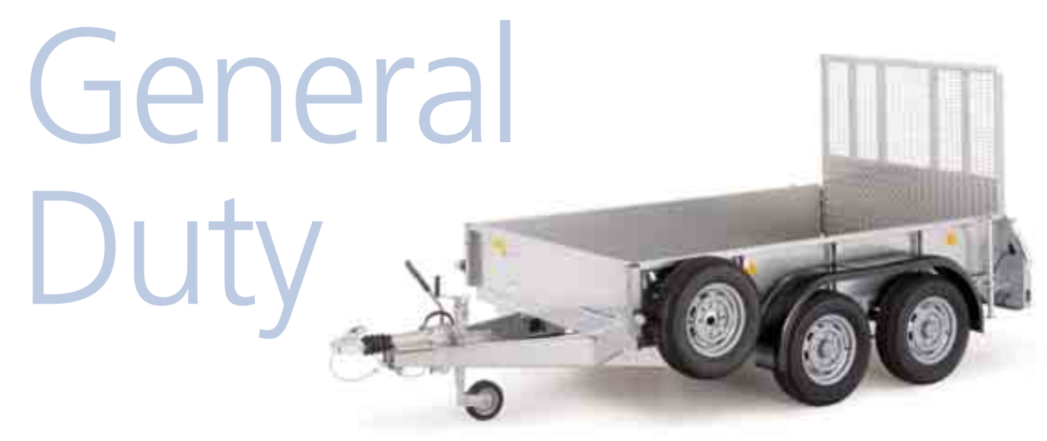
GD85 with ramp