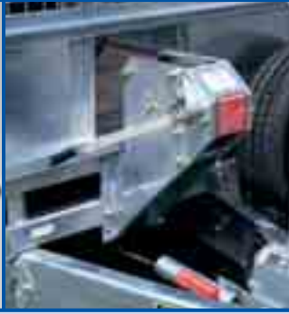
Braked manual winch

Ifor Williams trailers branded mud flaps. Can be fitted to LT/LM/CT range of trailers.