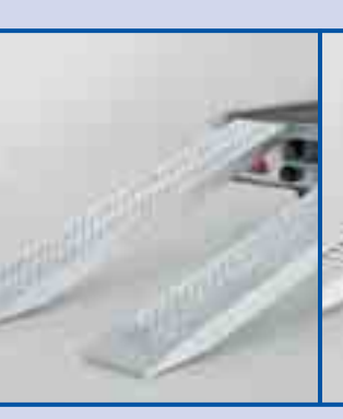
Perforated steel loading skids

Fitted to the GP and GX models, these are adjustable for width when deployed.