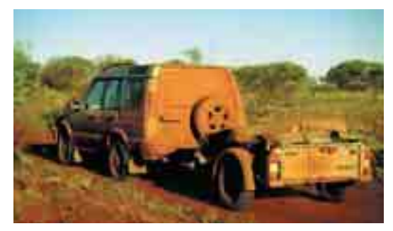
A GD64 at work in the Australian outback

Our General Duty trailers are at home in almost any environment, with virtually any type of load, from building materials to expedition equipment.