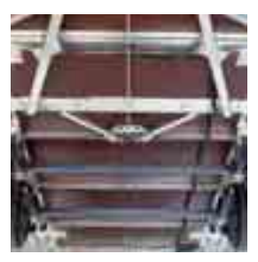
Chassis & floor

It's the attention to detail of Ifor Williams trailers that makes our products so popular with owners. Just take a look at these standard features.