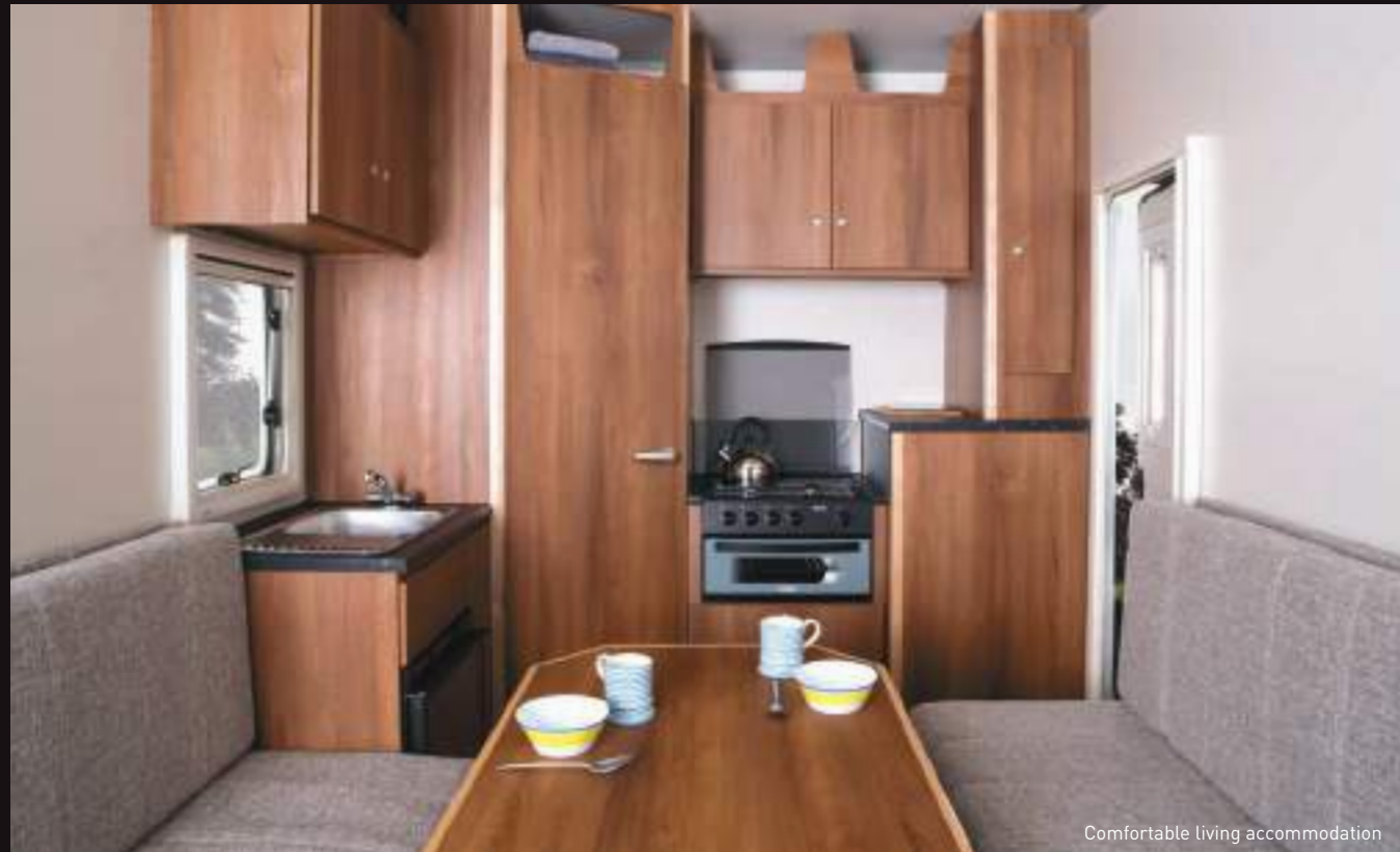
Comfortable living accommodation

As well as having your own peace of mind, Ifor Williams Trailers have a commitment to trailer security. Each trailer is fitted with an ID plate which has a unique serial number etched on to it. More information on trailer security can be found on page 27.