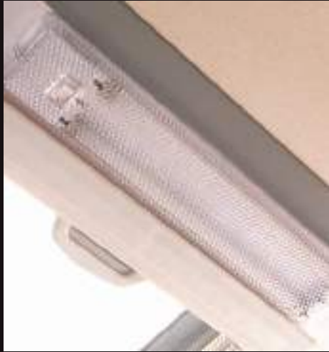
Internal Light Base trailer powered by Car Battery