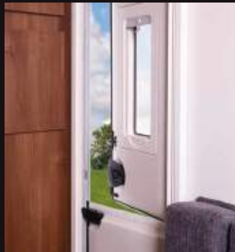
Lockable split entrance door with window and full sized fly screen