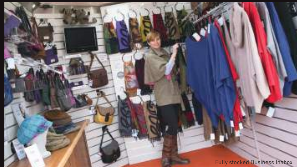
Fully stocked Business Inabox