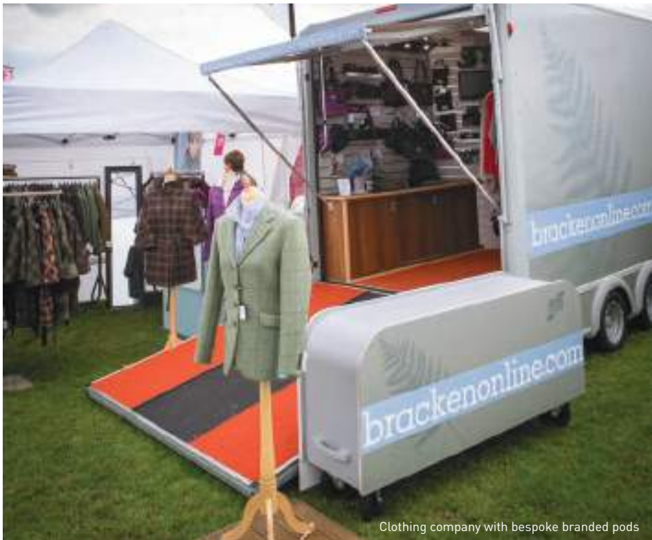
Clothing company with bespoke branded pods

Business Inabox enables you to trade at different events on consecutive days; a Town Centre on Friday, Rock Festival on Saturday and an Agricultural Show on Sunday; reaching a vast and varied audience in a short space of time.