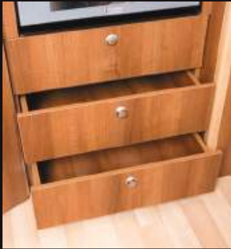
Living area storage