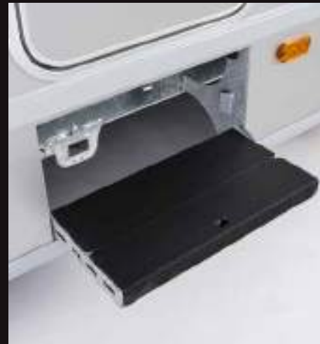
■ ■ Access Step