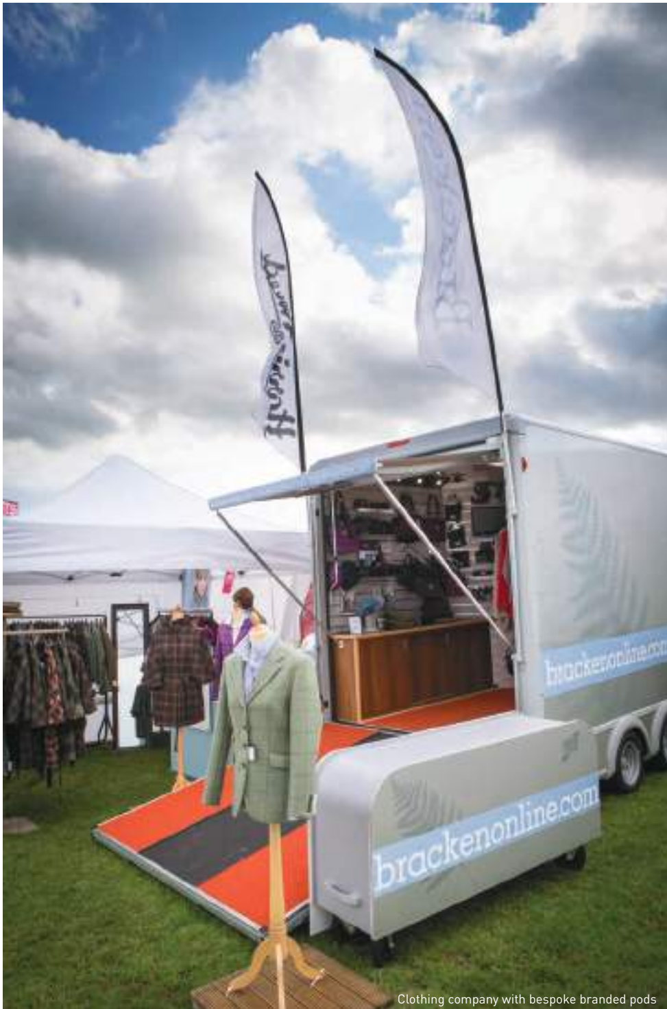
Clothing company with bespoke branded pods

* Street and Pedlars trading licences will be required. Please contact your local authority for information regarding which licence options will apply to your business and trading terms.