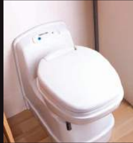
Electric Flush Toilet