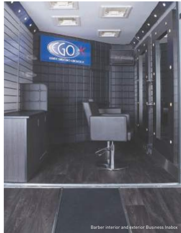
Barber interior and exterior Business Inabox