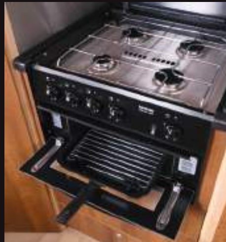
■ L Hob and Grill