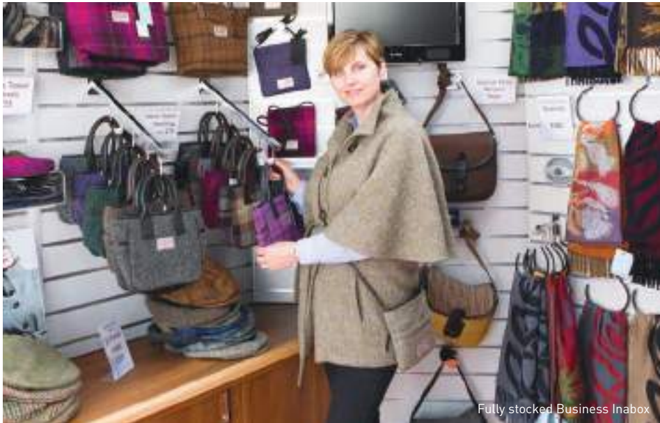
Fully stocked Business Inabox