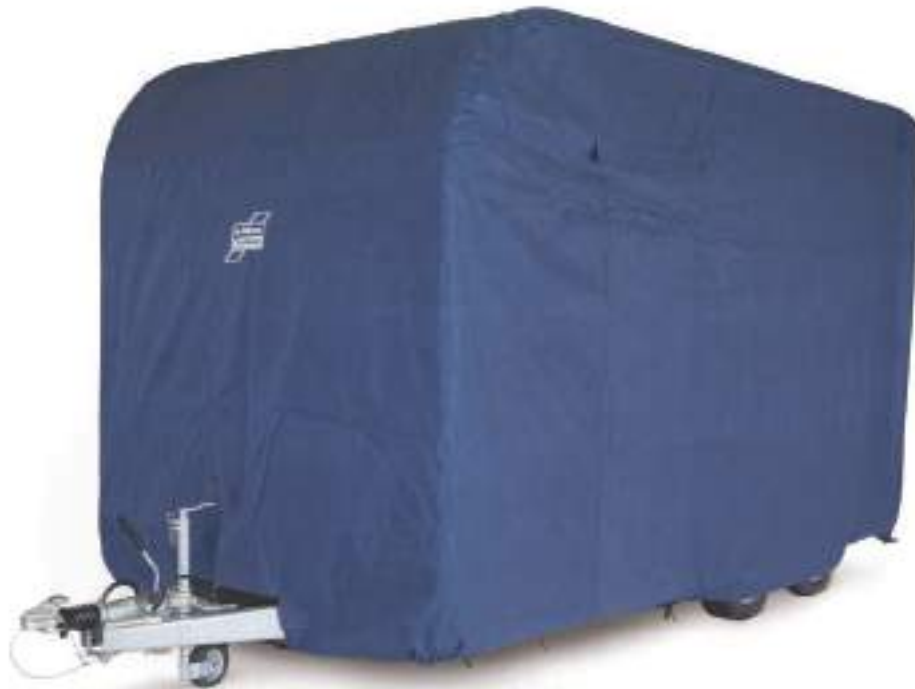
Trailer Cover—Protect your trailer from the elements with a waterproof and breathable trailer cover.