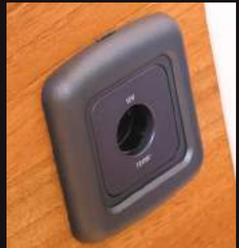
☑ 12v Sockets