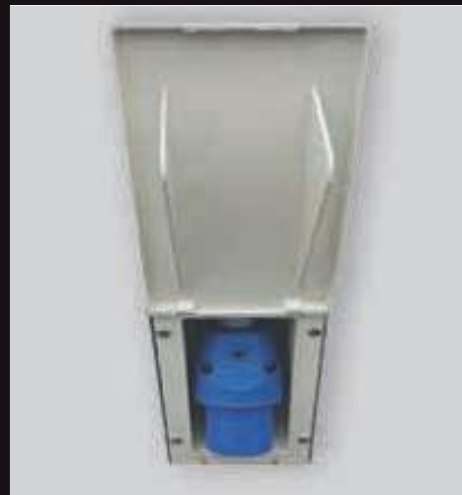
230v Hook Up