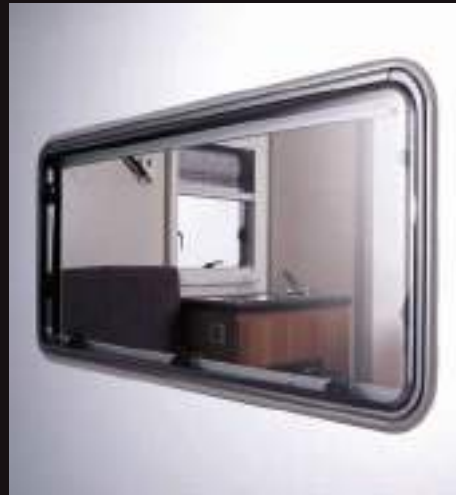
☑ Double Glazed Front Window