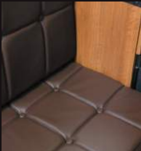
☑ Leather Upholstery