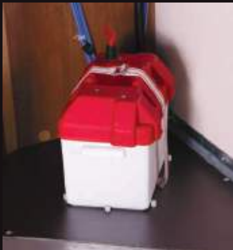
On board 12v electrics