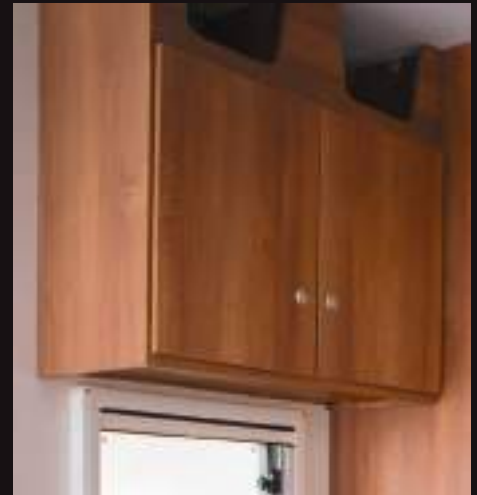
☑ Overhead Storage (over sink)