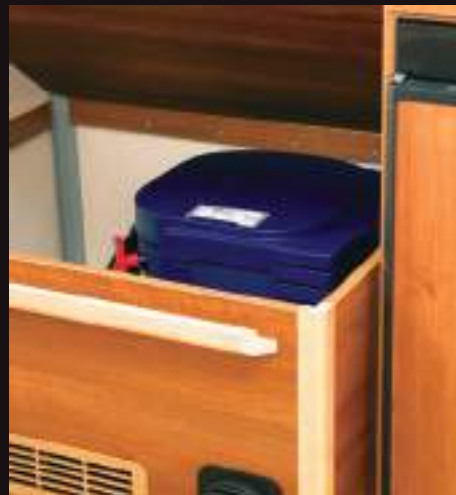
☑ Hot Water