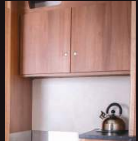
■ L Storage