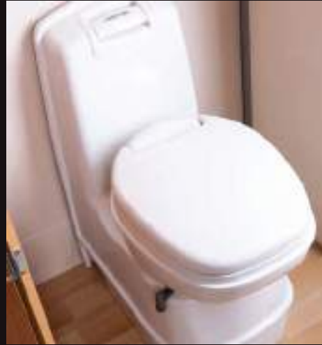
Manual Flush Toilet