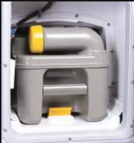
Waste Cassette (Comes as standard with a manual or electric flush toilet)