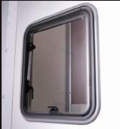
☑ Double Glazed Side Window